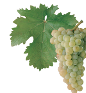
Sauvignon blanc Sauvignon