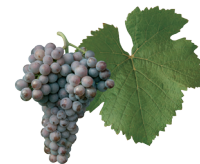
Pinot gris Rulandské šedé