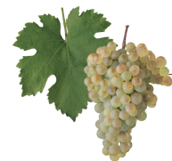
Grüner Veltliner Veltlínské zelené

The background of the wide range of Moravian and Bohemian wines is the combination of natural conditions and the work of human hands. There are more than a thousand wineries that do business in this field, from large companies to small family businesses in the Czech Republic. Another thousands of small private winemakers produce wine for their own consumption. The final style of individual wines is not determined only by terroir, diverse terrain, differing soils and microclimate but also by the winemaker's invention, experience, application of traditional methods and new trends. You can find everything but not insipidness or mediocrity in original Moravian and Bohemian wines.