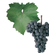
Saint Laurent Svatovavřínecké